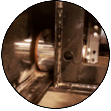
Adjustable ride height, load gauge and suspension dump valve.