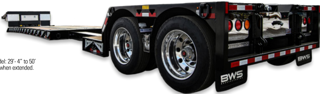
Gooseneck stinger arm.

*48" model: 29'- 4" to 50' of deck when extended.